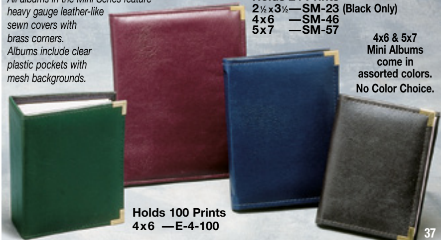
Holds 100 Prints 4x6 — E-4-100

4x6 & 5x7 Mini Albums come in assorted colors. No Color Choice.